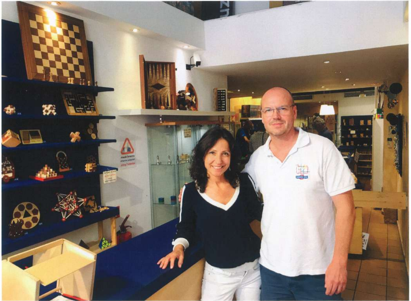
PHOTO CAPTION Inside the store.